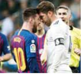
AFP ■ BARCELONA

More secured Valverde and Zidane out to prove supremacy in season's first Clásico